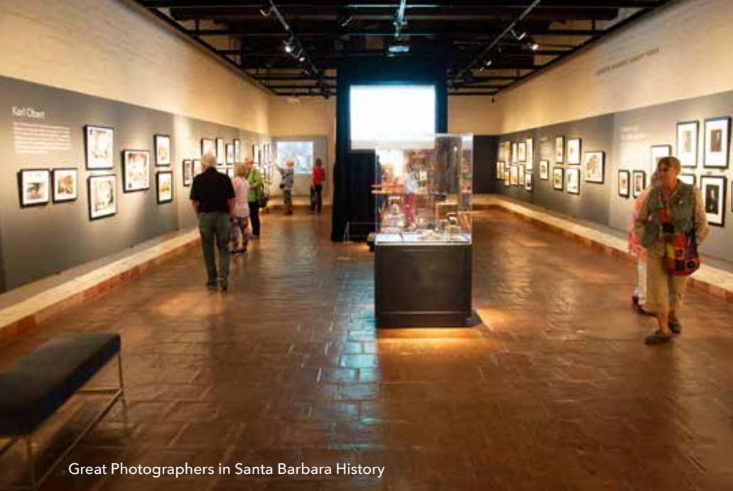
Great Photographers in Santa Barbara History