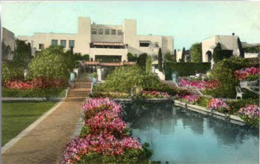
Above Three postcards from the Fritsche Collection: clockwise from left Eucalyptus Lane, the Yacht Harbor and Beach, and the Samarkand Persian Hotel.