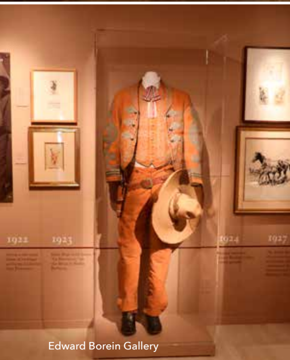
Edward Borein Gallery