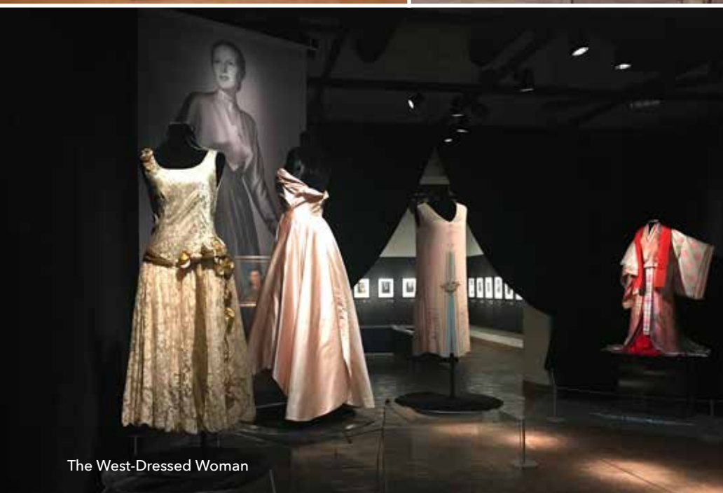
The West-Dressed Woman