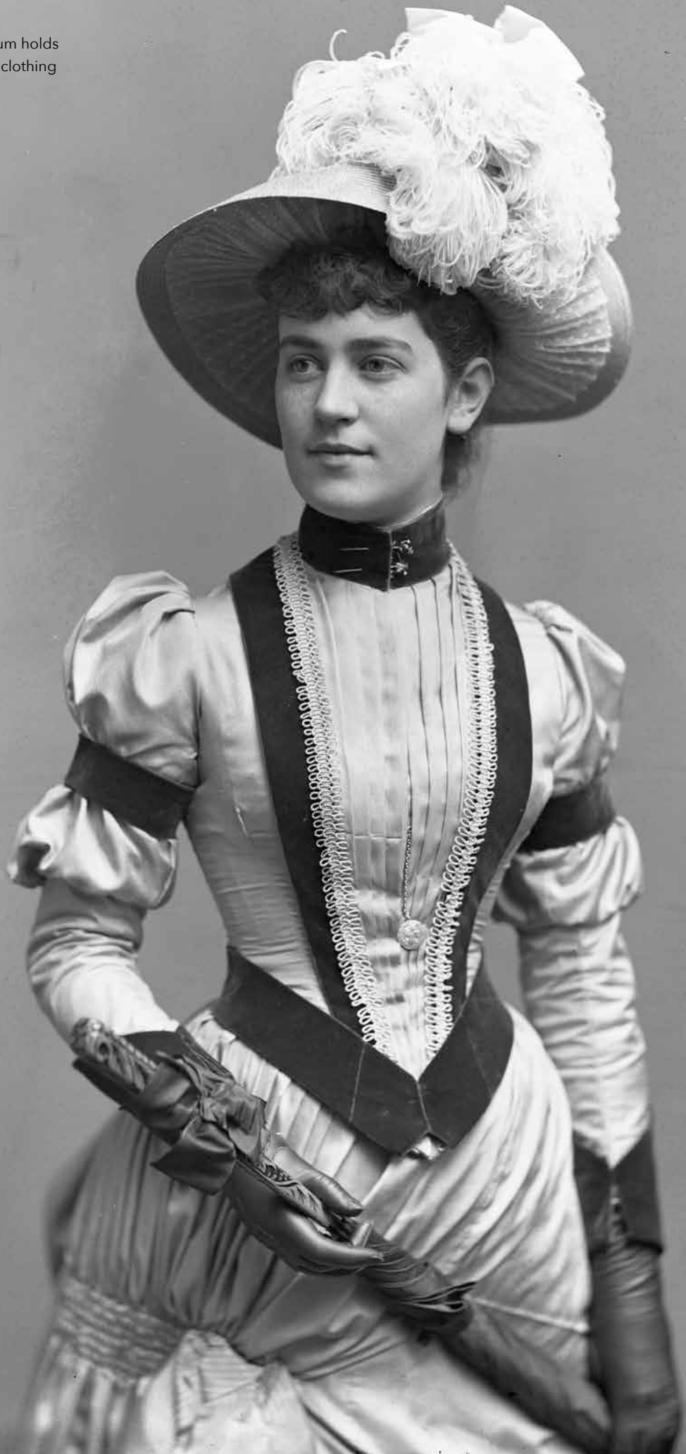
Did you know that the museum holds over 5,000 pieces of historic clothing in its collection?